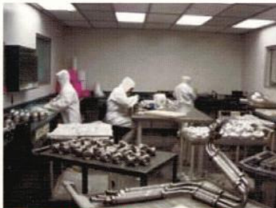
Chemical Cleaning and Painting